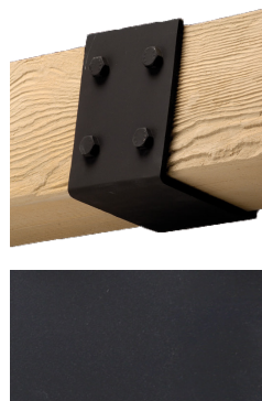
SMOOTH BEAM STRAP