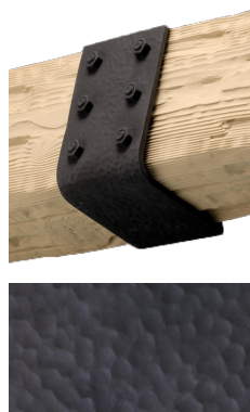
HAMMERED BEAM STRAP