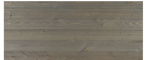
OLD BARN GRAY